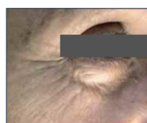
After 1 month