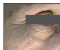
After 2 months